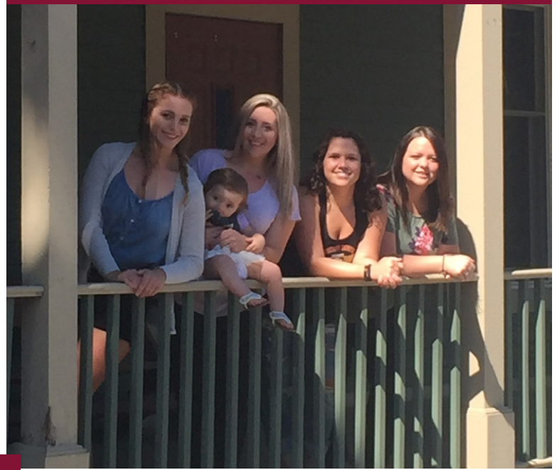
These, and other friendly faces can be seen at the historic Dryden Hotel.

family,” she said. “We go to each other’s weddings and baby showers. It’s like walking into Cheers, where everybody knows your name.”