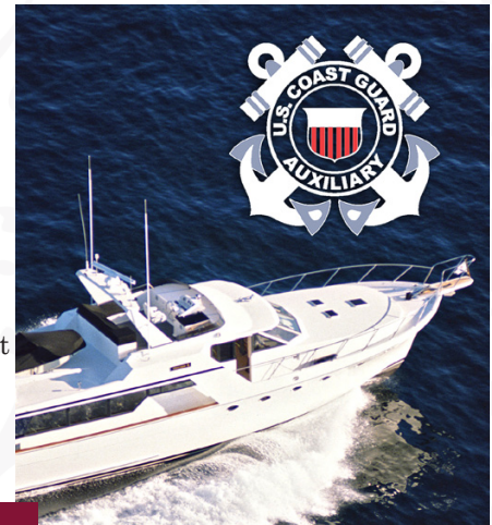
The Ithaca Flotilla of the US Coast Guard Auxiliary provides free safety checks on your water craft.