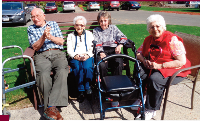
Residents at the Elizabeth Brewster House enjoy time outside near their gardens and the picturesque Tioughnioga River.